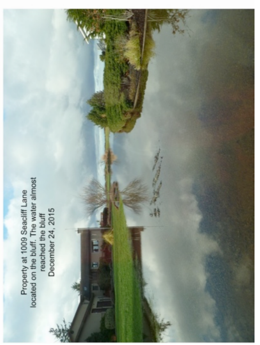
Page 5 of 5